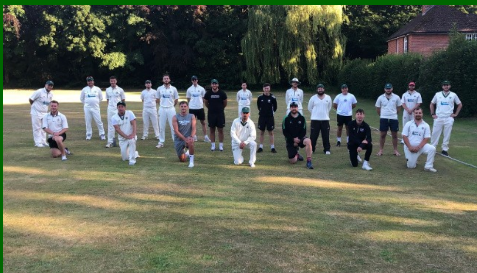
A socially distanced team picture at the start of the 2020 season